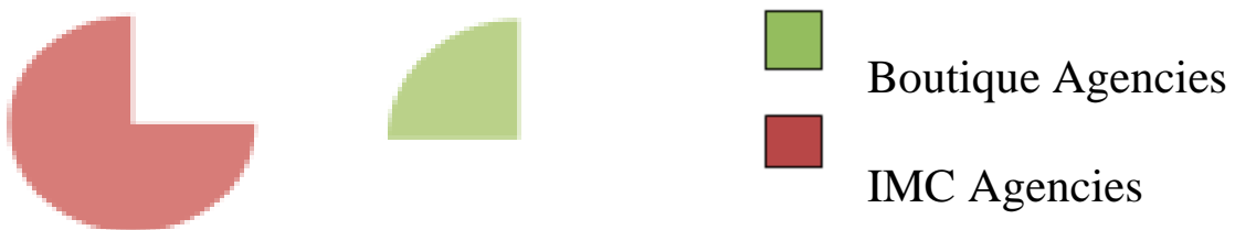
Figure 2: Search Engine Optimization (SEO)

The IMC agencies' Websites analyzed offer a larger number of services including search engine optimization (SEO), branding, graphic design, Website development, direct marketing and copywriting.